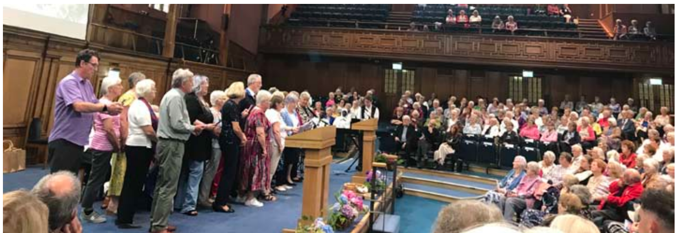
The Annual Gathering of Scotland's Guilds held in Edinburgh, attended by four members from Killearn.